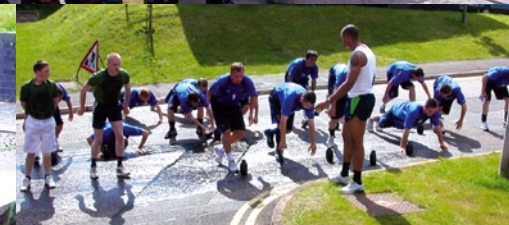
Brighton Hove Albion, Hartlepool Utd and Tranmere Rovers used the funds to partake in team building activities.