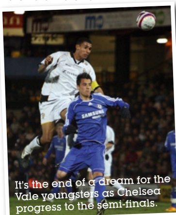
It's the end of a dream for the Vale youngsters as Chelsea progress to the semi-finals.

who helped himself to a hat-trick as the Londoners took the spoils with a 5 - 2 win in front of a 3,628 crowd at Vale Park.