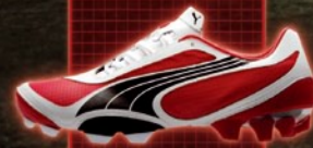
v1.08: THE SPEED BOOT