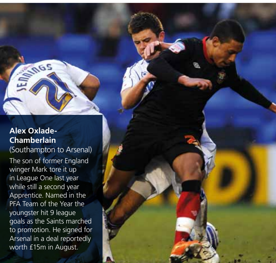
Alex Oxlade-Chamberlain (Southampton to Arsenal)

Henderson made huge strides after coming through his Apprenticeship at Sunderland in 2008. He made his England debut in November 2010 but his club couldn't resist the overtures of Liverpool when Kenny Dalglish came calling – the fee a cool £20m.