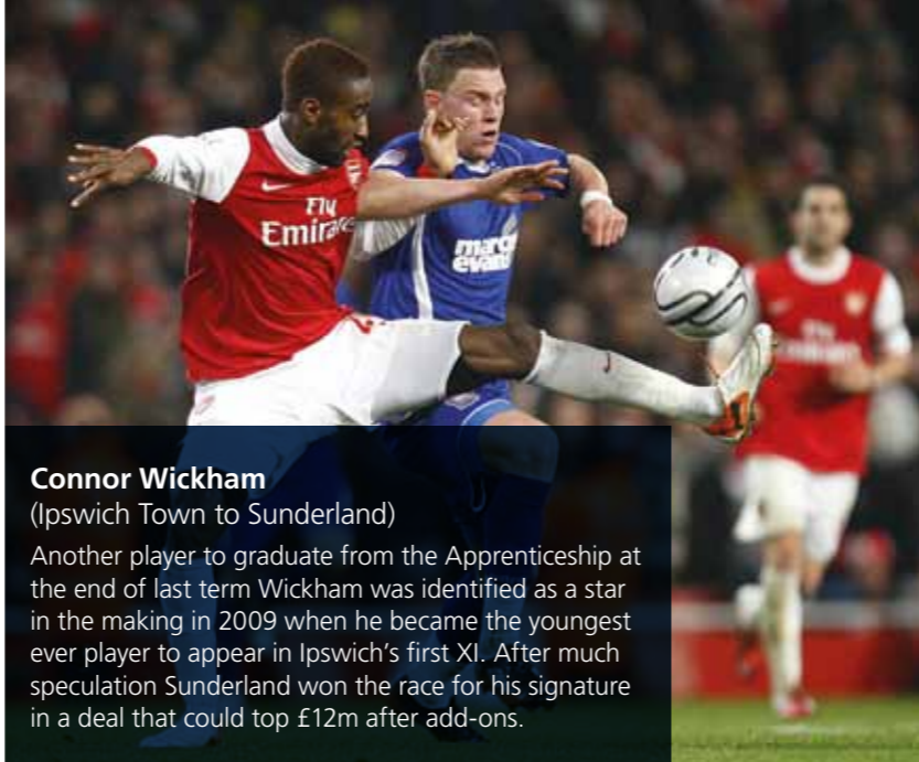
Connor Wickham (Ipswich Town to Sunderland)

This summer has seen a number of former Apprentices on the move. From those making their way to the very highest echelons of the game to those in more modest surroundings. Touchline runs the rule over this summer's activity to date.