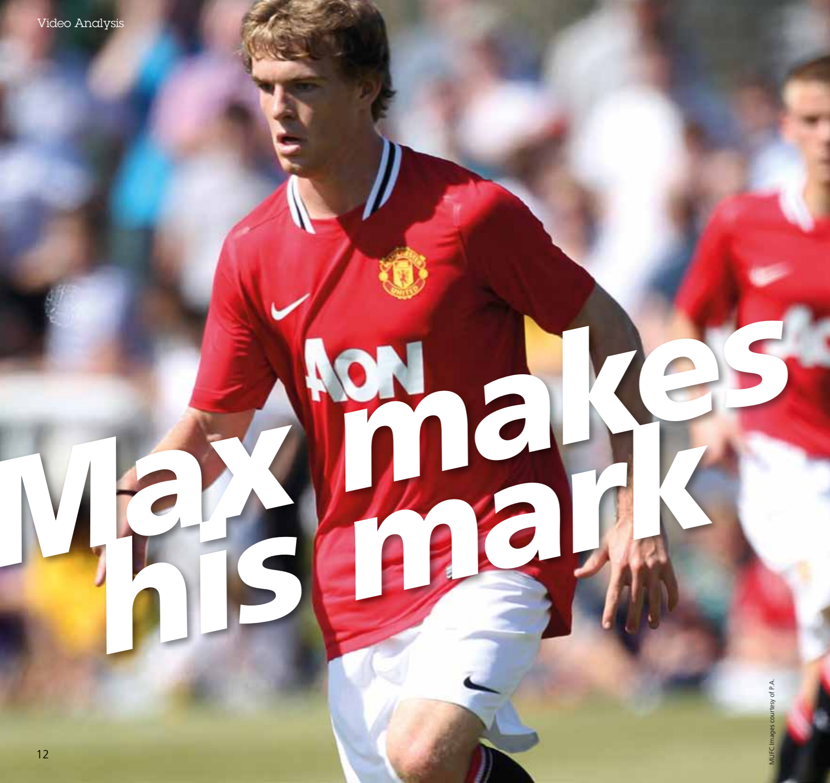
MUFC Images