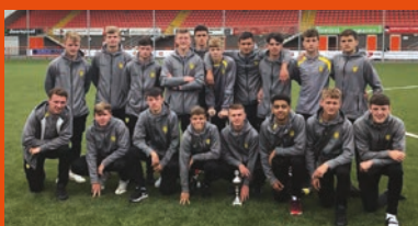
Burton's Under 18 players pose with a trophy for finishing as top English club in the Volendam Tournament.