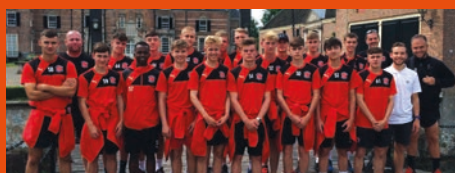
The Fleetwood Town Under 18 squad take a trip around Delden.