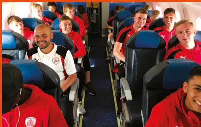
Airborne Barnsley head to the Netherlands.