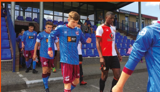
Scunthorpe take to the field for their game against Feyenoord.

Eight clubs jetted off with their apprentices to the Netherlands, while four others spent a fortnight in Spain (overleaf) for a pre-season trip promoting development and the exchange of ideas between coaches and players in various settings.