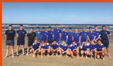
Hartlepool make the most of the hot weather with a training session on the beach.