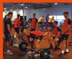
Exeter make use of the gym facilities with a weight training session.