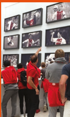
Barnsley youngsters enjoy a tour of the Amsterdam Arena.