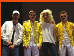
Hartlepool organise a team bonding night as the players dress up for some karaoke.