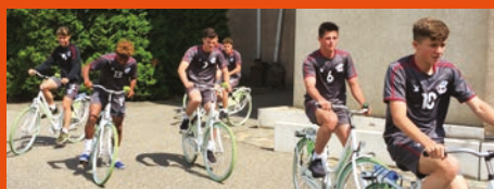
The Iron squad follow Dutch tradition by riding bikes to training.