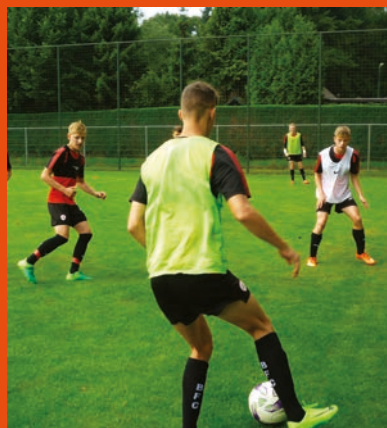
NAC Breda coaches organise a small sided possession based drill for the young Tykes.