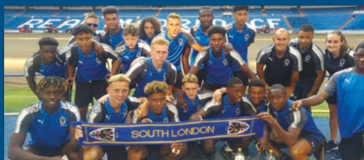
The Young Dons take time out of their Bernabeu tour for a squad photo.