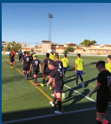
Huddersfield youngsters head onto the pitch as they take on UD Tomares.

Wimbledon substitutes are ready to be introduced during their game against AD Alcorcon.